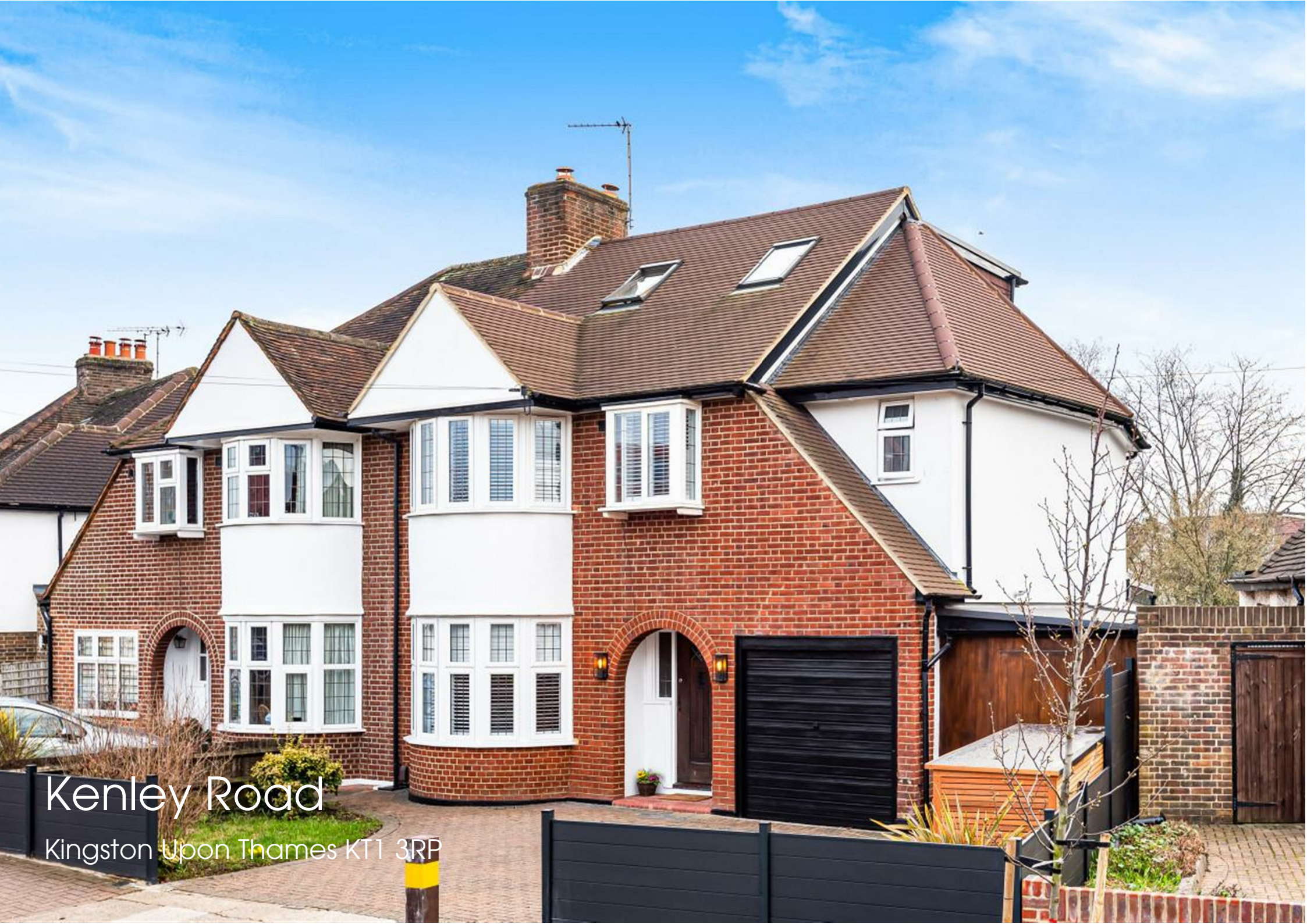
Kenley Road Kingston Upon Thames KT1 3RP

34 Richmond Road Kingston upon Thames Surrey KT2 5ED www.gibsonlane.co.uk Tel: 020 8546 5444